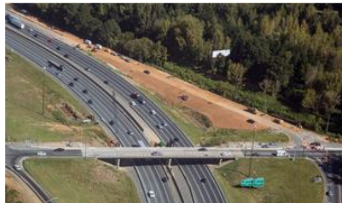
Aerial view of activities in the Uptown Charlotte area