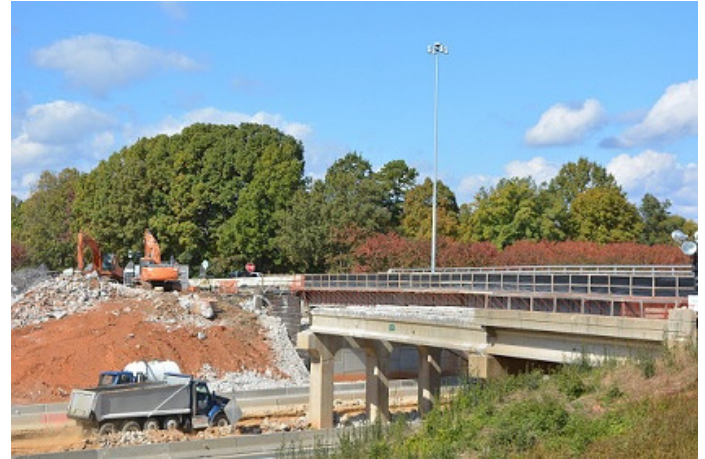
Demolition of the old Griffith Street bridge

A variety of bid opportunities are available for interested companies. If you know of anyone interested, please ask them to visit the contracting opportunities section on our website for details on how to apply.