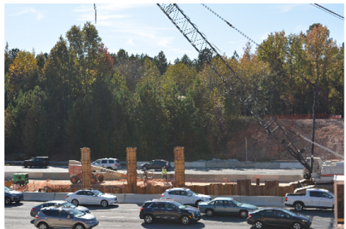
Work on bridge columns at the new Hambright Rd. direct connector