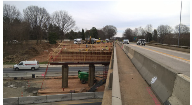
Construction of the foundation of the Griffith Street bridge in Davidson

A variety of bid opportunities are available for interested companies. If you know of anyone interested, please ask them to visit our website www.i77express.com and click on the contract opportunities tab for details on how to apply.