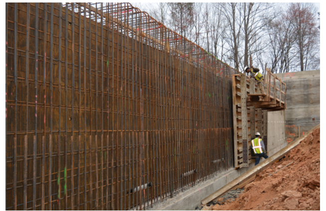
Pedestrian culvert wall construction north of Exit 23 in Huntersville