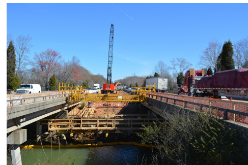
Lake Norman bridge widening area

A variety of bid opportunities are available for interested companies. If you know of anyone interested, please ask them to visit the contracting opportunities section on our website for details on how to apply.