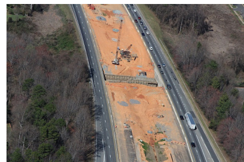
Pedestrian culvert north of Exit 23 Gilead Rd. in Huntersville