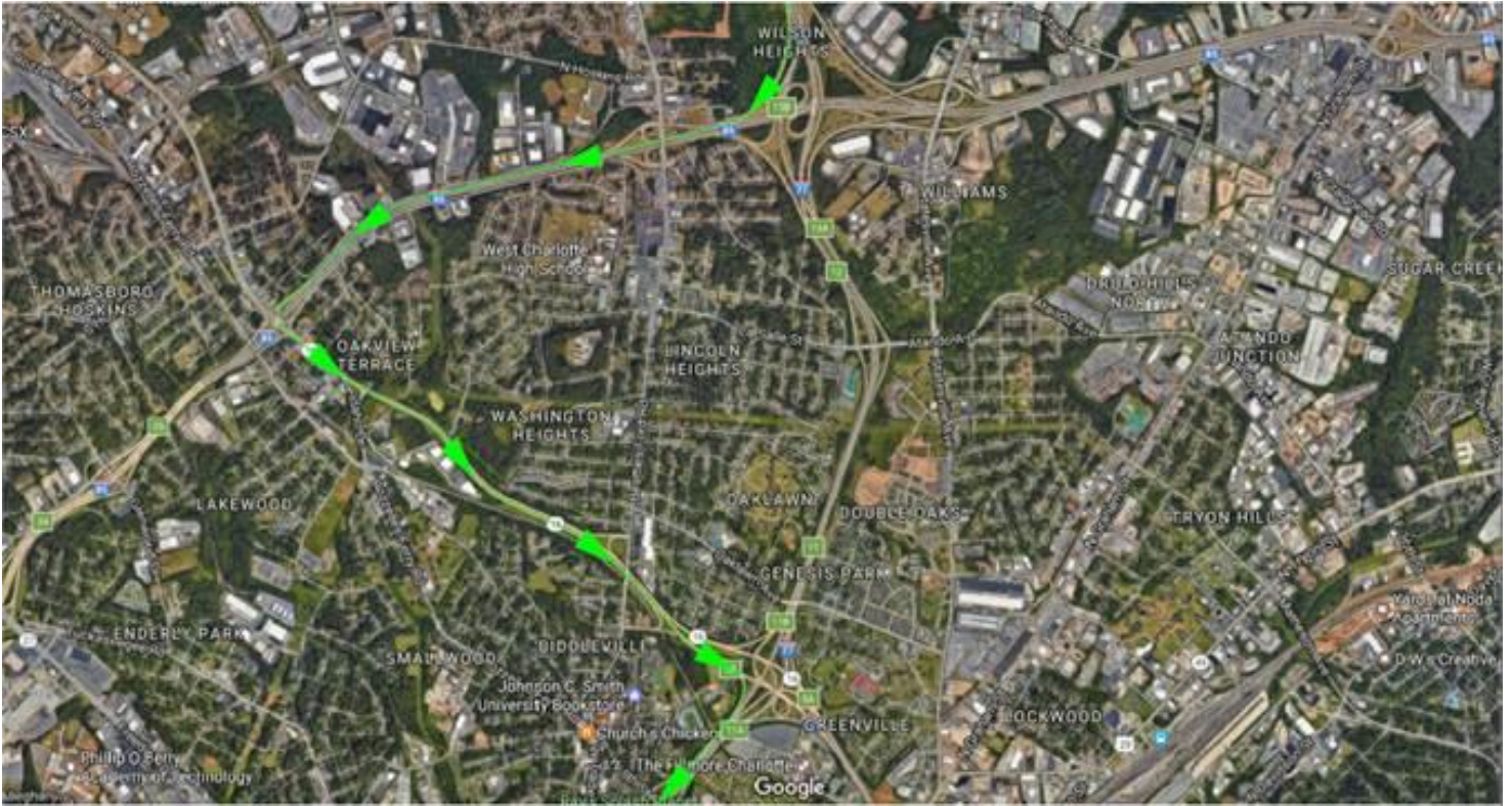
I-77 Southbound Detour