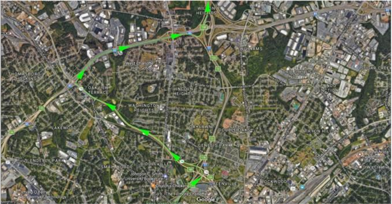
I-77 Northbound Detour