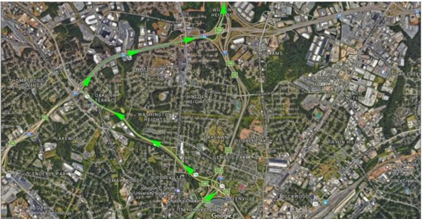
I-77 Northbound Detour